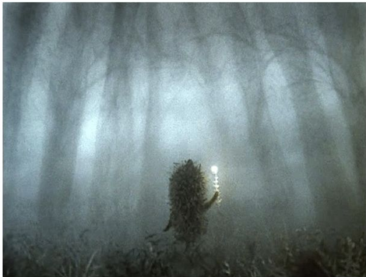
Still from Hedgehog in the Fog , Soyuzmultfilm, 1975.